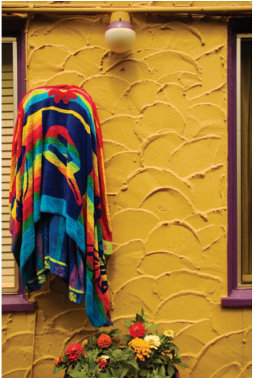
Towel in Capitola, CA