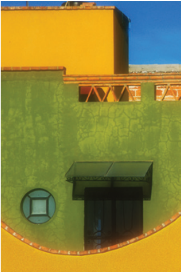
San Miguel building